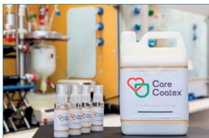
CareCoatex™ antimicrobial coating