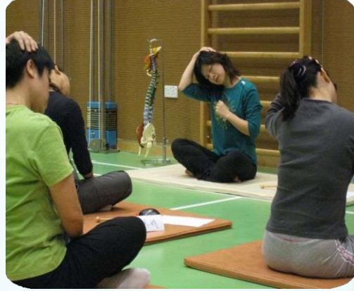
公眾教育 Public Education