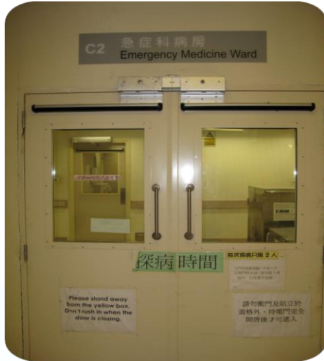
急症處理 Emergency Treatment