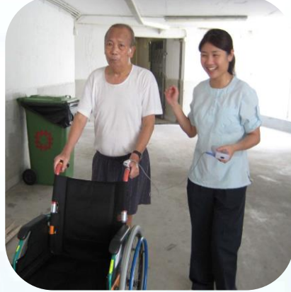
及早支持出院計劃 Discharge Planning