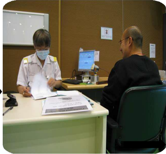
門診物理治療 Out-patient Clinic service