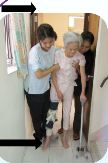
社區物理治療 Community-based Physiotherapy