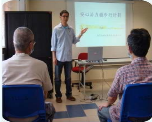
基層護理 Primary Healthcare