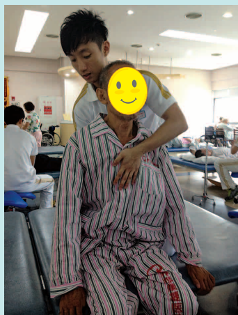
Hands on practice of facilitation skills

During the record breaking high temperatures in Shanghai this summer, seven PT students and eight OT students had their four-week summer placement at the Shanghai Sunshine Rehabilitation Centre.