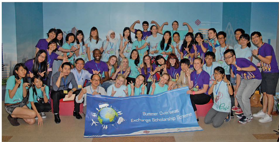
A friendly and happy ending of the programme

and neurological rehabilitation, neurorehabilitation, and musculoskeletal and sports rehabilitation were organized. After the orientation, participants went out on the fourth day to visit the rehabilitation facilities of Kowloon Hospital and the Tung Wah Group of Hospitals (TWGHs) Jockey Club Rehabilitation Complex. On the fifth day, overseas students met with their selected