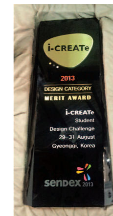
This is the Merit Award

In this competition, we were given the opportunity to exchange ideas on rehabilitation technology with people from different backgrounds and countries such as Korea, Thailand,