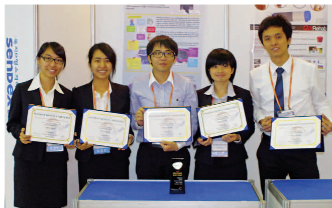
We received the Merit Award in the Design category of the Student Design Challenge

We were excited to join Asia's biggest symposium and conference on rehabilitation and assistive technology, the 7th International Convention on Rehabilitation Engineering and Assistive Technology (i-Create), which took place in Korea.