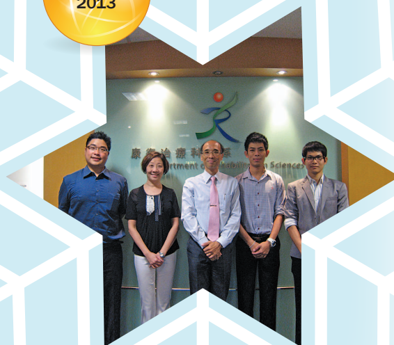
Visit by delegates of KhonKaen University, Thailand