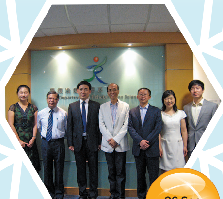
Visit by delegates of 無錫市同仁國際康復醫院