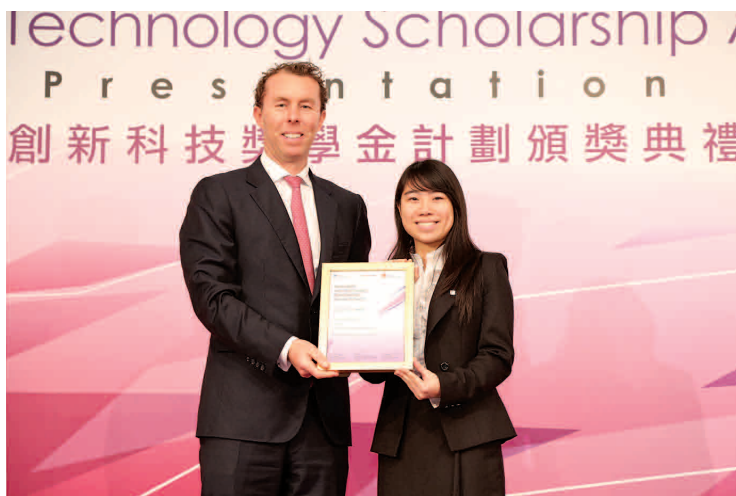
The Innovation and Technology Scholarship Award Scheme presentation ceremony

Apart from international experience, each awardee was assigned a mentor to guide them. I was glad to be matched with Prof. Nancy Ip, Dean of Science of HKUST who is a renowned neuroscientist and internationally recognized for her discoveries in neurotropic