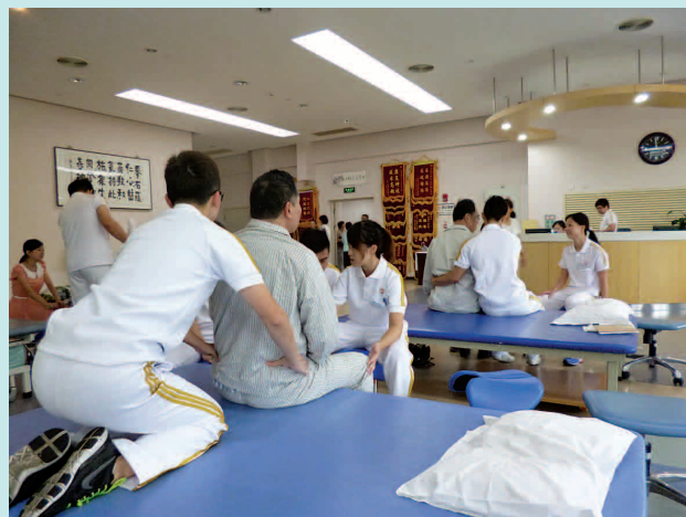
Learning through clinical practice

Students covered stroke, spinal cord injuries, and paediatric clients. Although, the environment is quite different from Hong Kong, the students performed well and integrated their clinical reasoning and neurological rehabilitation skills