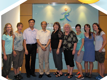
Visit by delegates of Pacific University, US