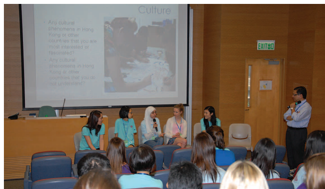
Overseas and local students were exchanging their ideas in open forum

The summer school ended with a closing ceremony and tea reception. During the reception, many overseas students asked if a similar programme will be organized next year and expressed interest in promoting SOESS among their peers. With this experience we hope SOESS will become a regular practice in the future to accomplish the goal of globalization.