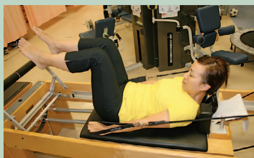
A client practising Pilates training under the supervision of a physiotherapist

Since Pilates training is targeted to an individual's health conditions, clients with any form of joint pain or injuries and those with postural problems will benefit. For further information about this service, please visit the Rehabilitation Clinic website at www.rehabclinic.org .