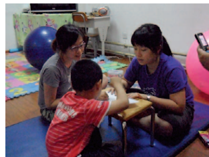
Occupational therapy students working with a child in Xinjiang

Last summer, I joined a Preferred Graduate Development Programme (PGDP) in Xinjiang with a group of occupational therapy and physiotherapy students. This placement was supported by the Goodrock Foundation. We spent four weeks working at different orphanages in two cities, Urumqi and Shihezi. The orphanages provide foster care, special education and rehabilitation services to orphans and children with disabilities, such as a mental handicap, cerebral palsy, autism and developmental delay. Some of the children suffered from severe conditions that we had never encountered before.