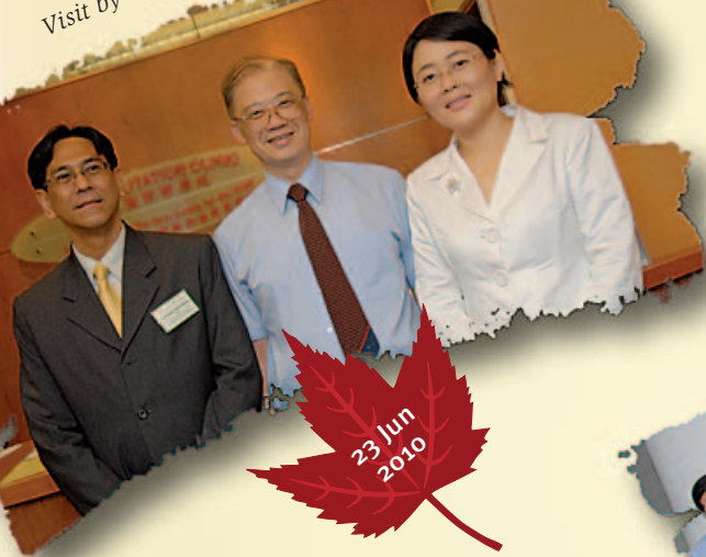
Visit by Universiti Teknologi MARA, Malaysia