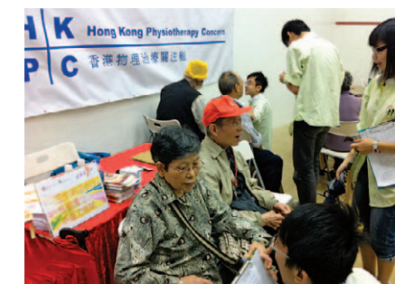
Many visitors come to our booth to receive free health assessments and professional advice