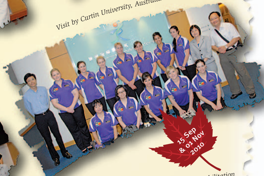
Visit by Curtin University, Australia