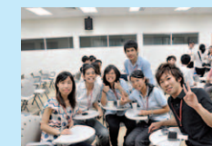
First Congress of the Asia Physical Therapy Student Association p.3