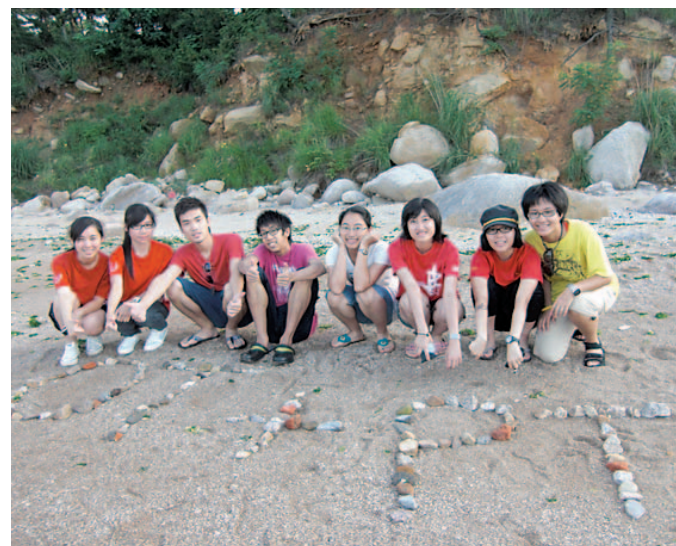
Happy together - PT and OT students enjoying the beach at the beautiful Qingdao

Although most of the teachers, therapists and foster mothers in the orphanages were not trained as rehabilitation