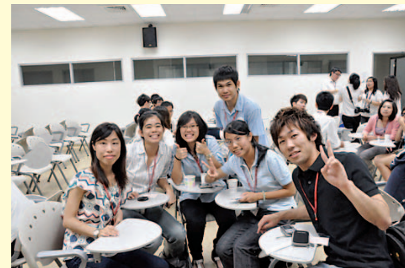
Meeting physiotherapist students from Asia

It was my pleasure to work with physical therapy students from different countries and contribute to our profession. In addition to gaining knowledge, I also made many new friends. I hope more students can join the activities of APTSA in the future, which I am sure will be a meaningful and valuable experience for them.