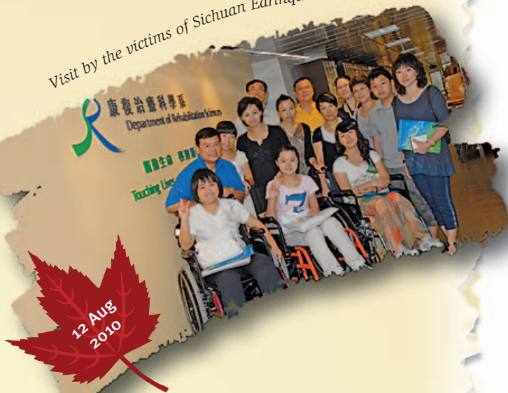
Visit by the victims of Sichuan Earthquake