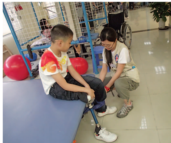
Physiotherapy student providing training for an amputee child at Deyang

Our PGDP experience was truly memorable! We were provided with valuable opportunities to take care of patients in China. Some of us encountered patients with severe burn injuries due to a work accident in Guangzhou, while others assisted in the recovery of amputees in Sichuan after a devastating earthquake.