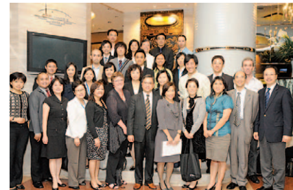
Group photo after the conference dinner

23 & 24 Oct 2010 The 7 th Pan-Pacific Conference on Rehabilitation