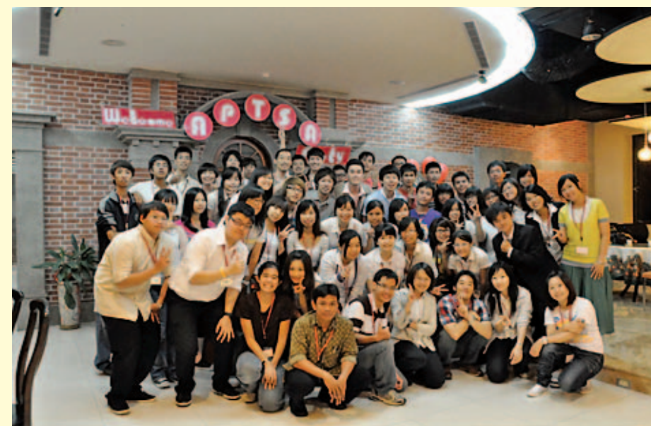
The APTSA family after a welcoming dinner