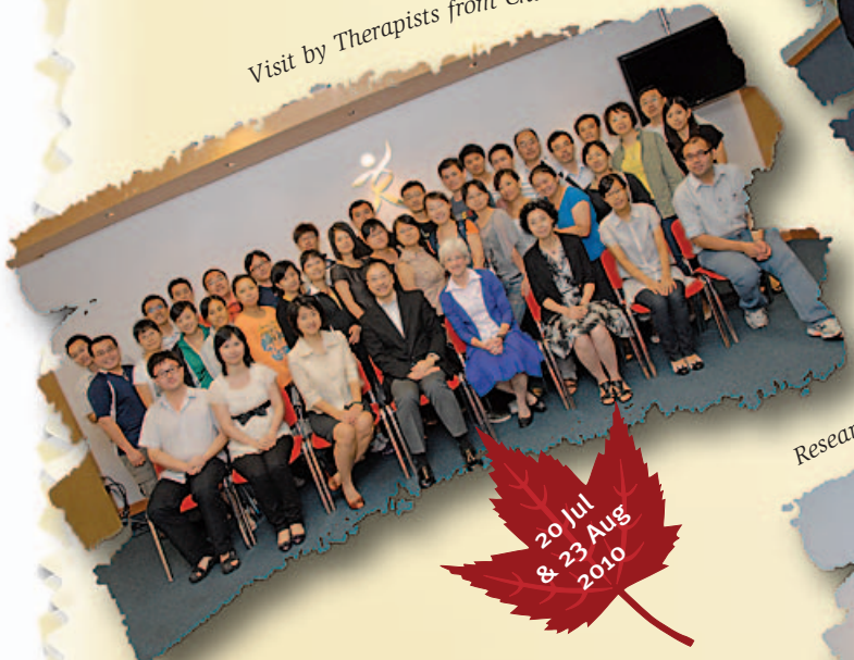
Visit by Therapists from China