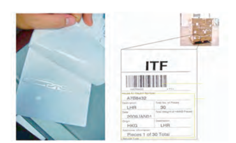
FRED application on a RFID-enabled air waybill label

PolyU implemented Radio Frequency Identification (RFID) technology in air cargo processing system, in order to enhance Hong Kong's competitiveness in the air freight forwarding industry. Flexible RFID Encoder and Decoder (FRED) uses a flexible XML-based data encoding scheme and a data compaction algorithm, in which essential air cargo data can be written onto RFID tags efficiently and according to user specified data format for identification and processing purposes. This integrated system also provides movement detection capability and tag rewriting mechanism to enhance its flexibility. FRED application can be further extended to support a wide range of RFID-based applications.