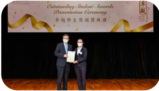
2020 Outstanding Student Awardee