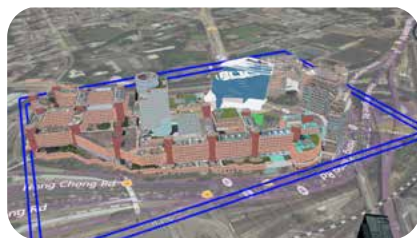
3D Model of PolyU

主修土地測量及地理資訊學(榮譽)理學士學位課程的學生另可申請第二主修「人工智能及數據分析(AIDA)」，該課程包括跨學科的學習，旨在為學生提供的地球科學、程式設計、統計學、數學等基礎，以致應用於大數據、人工智能及智慧城市相關應用的進階學習，培養具備新興科技解難技術的畢業生。