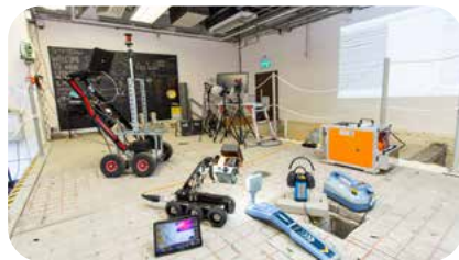
Instrumentation in Underground Utility Survey Lab

學系與業界及專業團體保持密切聯繫，並不時邀請行業專家為學生進行客座講座。每年約有四成的學生獲得海外交流或實習等學習機會，開拓學生國際視野。