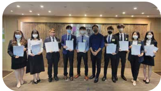
Awardees in HKIS Scholarship and Dissertation Awards in 2022