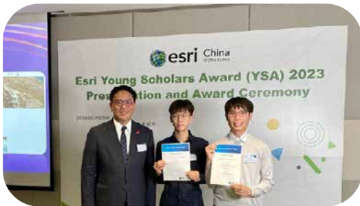
Awardees in ESRI Young Scholars Award 2023