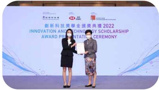
Innovation and Technology Scholarship Award 2022