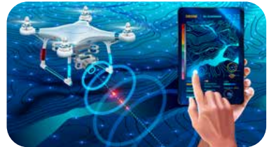
Data acquisition by UAV