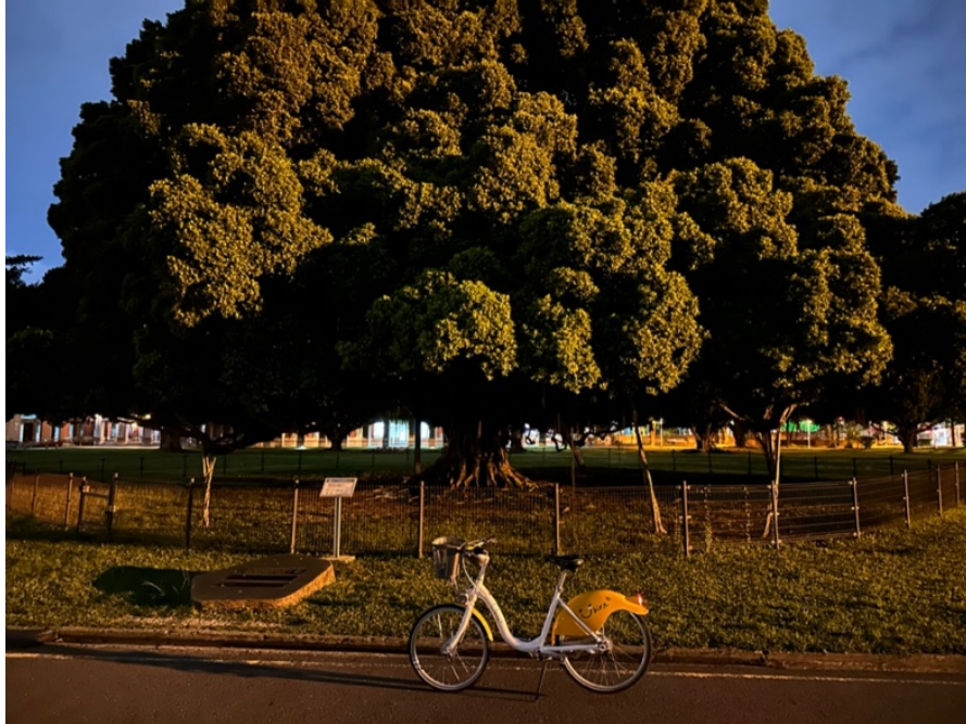
Fig 3. Cycling in the NCKU campus at midnight

I also learnt a lot from my classmates in the host countries. Apart from actively sharing their opinions and insights during class. One incident that left a lasting impression on me occurred when I returned to university at midnight. Despite the late hour, I was astonished to find numerous students studying in the 24-hour study area. Witnessing their unwavering commitment to their studies deeply impacted me. The collective motivation and perseverance exhibited by these students created an atmosphere conducive to academic growth and instilled in me a newfound determination to excel.