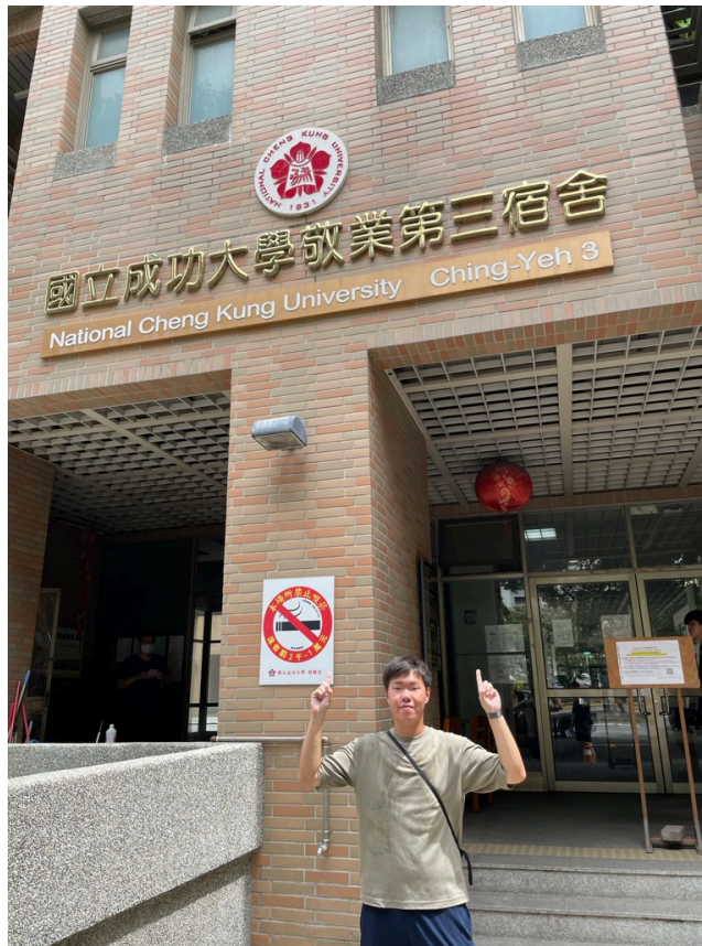
Fig 2. NCKU Ching-Yeh 3 Dormitory

At NCKU, a remarkable learning experience was participating in the AI Cup competition. This nationwide event for Taiwanese university students challenged my AI skills and allowed me to learn from others' unique ideas. Competing with students from across Taiwan provided valuable insights and expanded my knowledge in the field.