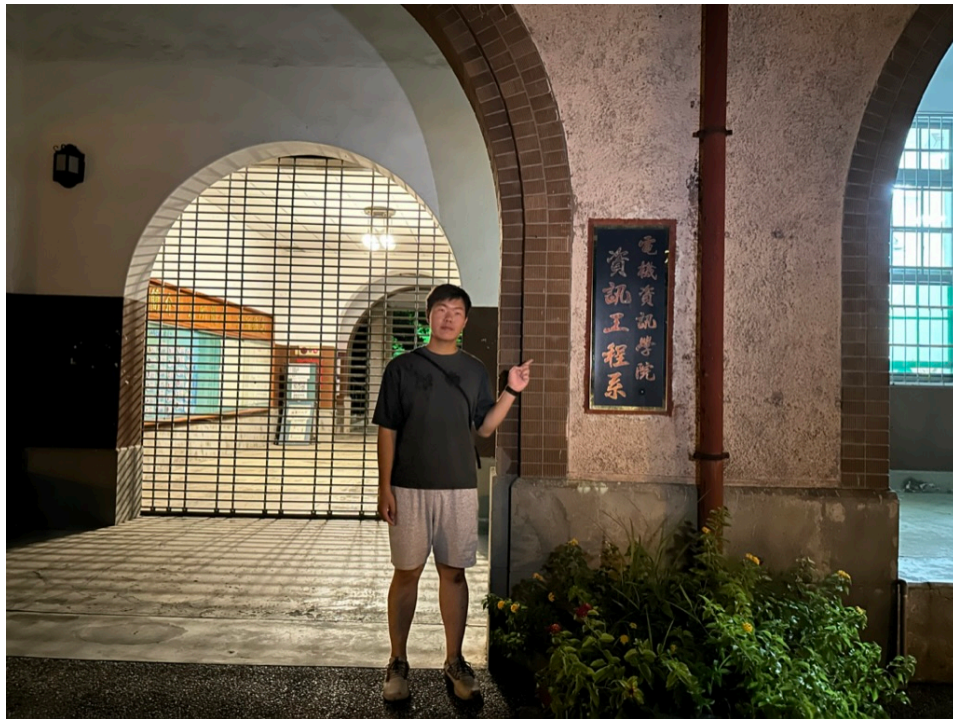
Fig 1. Department of Computer Science and Information Engineering

The academic experience at NCKU brought me new experiences in learning. The university provided ample opportunities for practically applying the knowledge learned from the lectures, which proved immensely beneficial for students' future careers. Engaging in hands-on learning allowed us to grasp the real-world implications of the theories we studied. What particularly struck me was the remarkable learning attitude demonstrated by Taiwanese students. My classmates actively shared their opinions and insights. Their willingness to contribute to the class created a stimulating environment, providing me with valuable perspectives to broaden my own understanding. I am very inspired by their passion for learning.