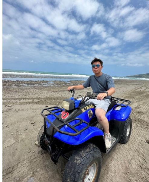
Fig 4. Dune Buggy in Kenting