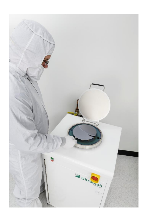
Ultratech Savannah ALD System