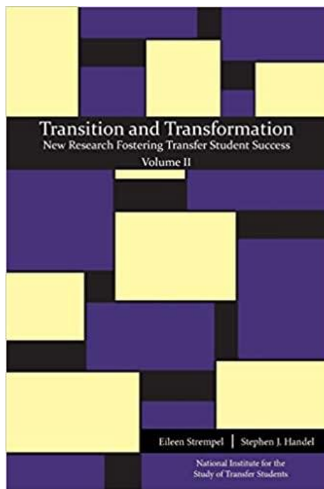
Transition and Transformation: Fostering Transfer Student Success Volume 2