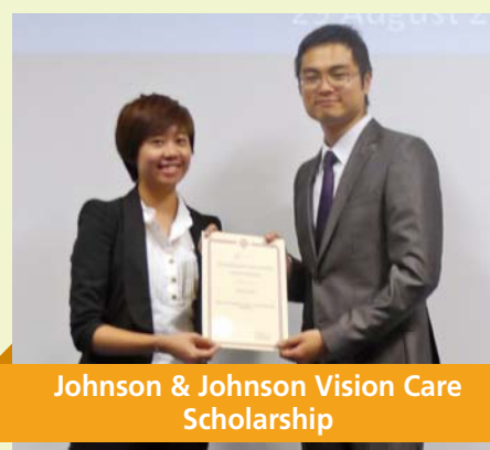
Johnson & Johnson Vision Care Scholarship