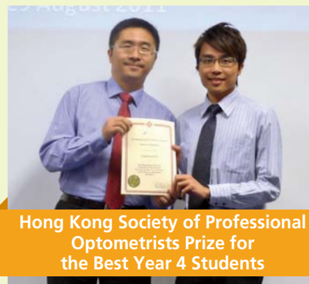
Hong Kong Society of Professional Optometrists Prize for the Best Year 4 Students