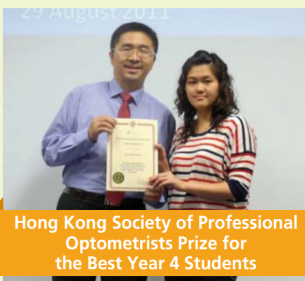
Hong Kong Society of Professional Optometrists Prize for the Best Year 4 Students