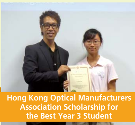
Hong Kong Optical Manufacturers Association Scholarship for the Best Year 3 Student