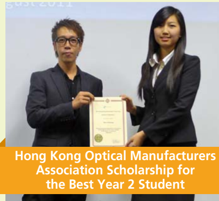
Hong Kong Optical Manufacturers Association Scholarship for the Best Year 2 Student