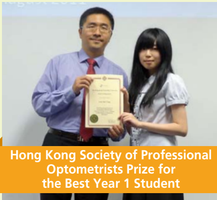
Hong Kong Society of Professional Optometrists Prize for the Best Year 1 Student