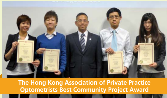
The Hong Kong Association of Private Practice Optometrists Best Community Project Award