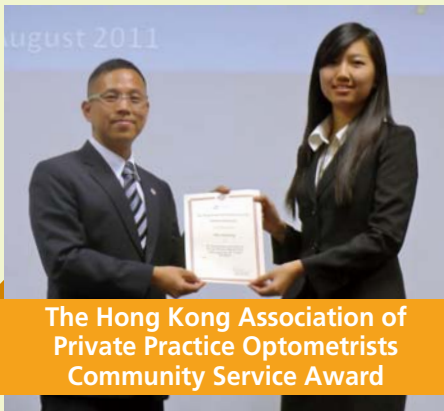
The Hong Kong Association of Private Practice Optometrists Community Service Award