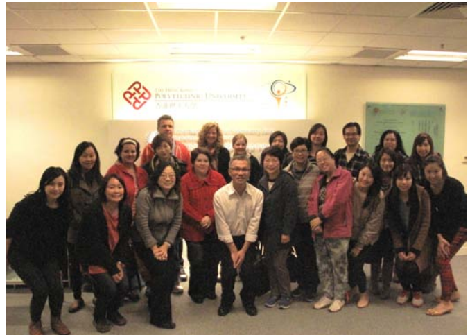
Mental Health First Aid Courses (December 2013)