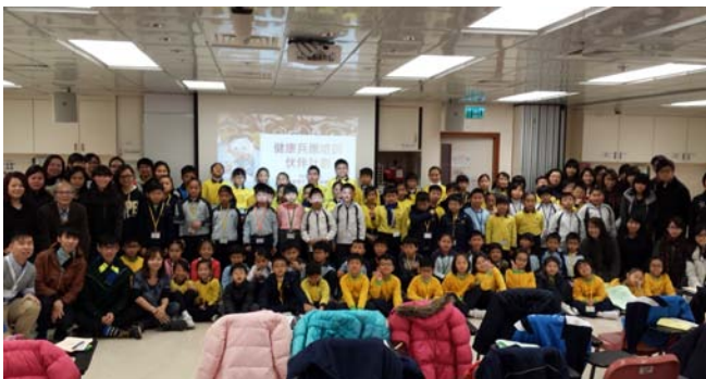
Mentorship Programme for Training Health Ambassadors in the School Communities (December 2013)