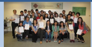
Mental health first aid courses (May 2013)