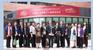
Visited by delegates from the Singapore's Ministry of Health (Oct 2012)