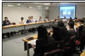
Meeting with overseas advisors through internet