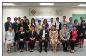
Group photo with all participants at the meeting