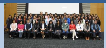
Disaster nursing training course (Nov 2012 – Feb 2013)