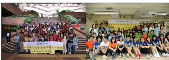
Provision of health assessment and screening services to the elderly and mentally disabled people through InterProfessional Collaborative Practice (June - August 2013)