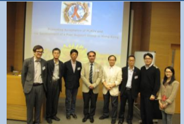
"Walk with Love" seminar for promoting HIV prevention (Nov 2012)