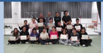
Course for management of violence and aggression (Jan – Feb 2013)