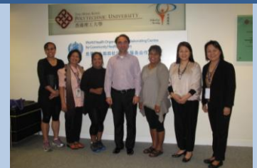
Visited by the WHO-sponsored participants of the 20th Infection Control Course for Health Care Professional 2013 (Mar 2013)