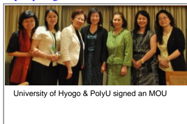
University of Hyogo & PolyU signed an MOU