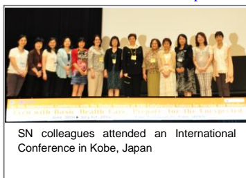
SN colleagues attended an International Conference in Kobe, Japan