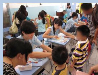
Health assessment for students and their families at school (Hong Kong)