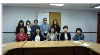
SN colleagues had participated in a group discussion with representatives from China, Japan and Korea