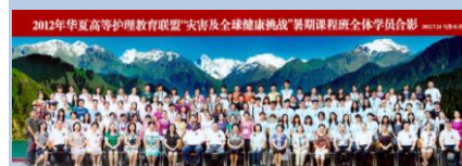
Summer programme 2012: Disaster and global health challenges (Xinjiang, China)