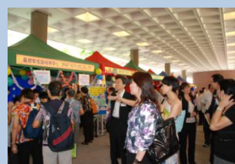
Booth for health promotion (Hong Kong)