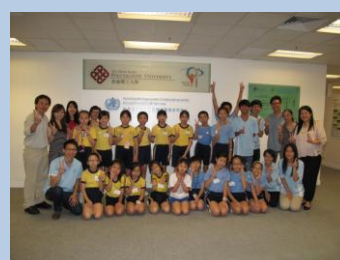
Health ambassador summer training programme for primary school students (Hong Kong)