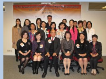
The first 'Creating synergy for school nurses across the region' symposium and seminar (Hong Kong)