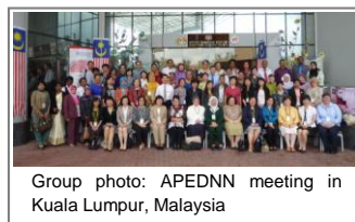
Group photo: APEDNN meeting in Kuala Lumpur, Malaysia