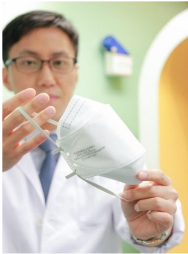
◀ PolyU new N95 respirators with unique adjustable elastic straps.

PolyU has filed a patent at the Patents Registry, Intellectual Property Department, HK Government, for the unique 'adjustable elastic straps' of our respirators (filer's ref: HK32020021992.3) and a license agreement was signed on 11 January 2021 between PolyU and our collaborator, Vannex International Limited. This sets the ground for bulk manufacturing of the respirators for commercial and clinical uses.