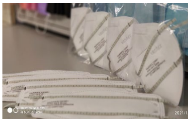
◀ PolyU new N95 respirators come in two face sizes for perfect fit.