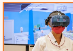
Players need to identify the pitfalls of clinical practice, prioritise and complete the nursing tasks within a limited time.

Click here to watch the School's video about the Virtual Hospital.