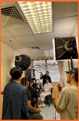
In the photo: The production team was producing the videos for the course.