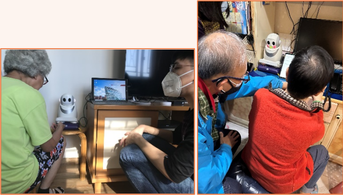
Left photo: A member of the research team taught an older person how to use Ka Ka . Right photo: Ka Ka provided a common topic of conversation.