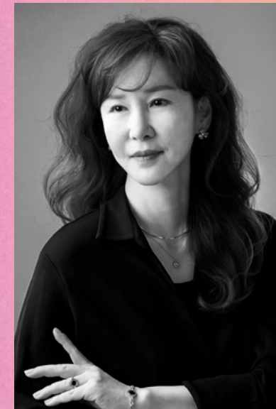
Dean, School of Fashion and Textiles The Hong Kong Polytechnic University