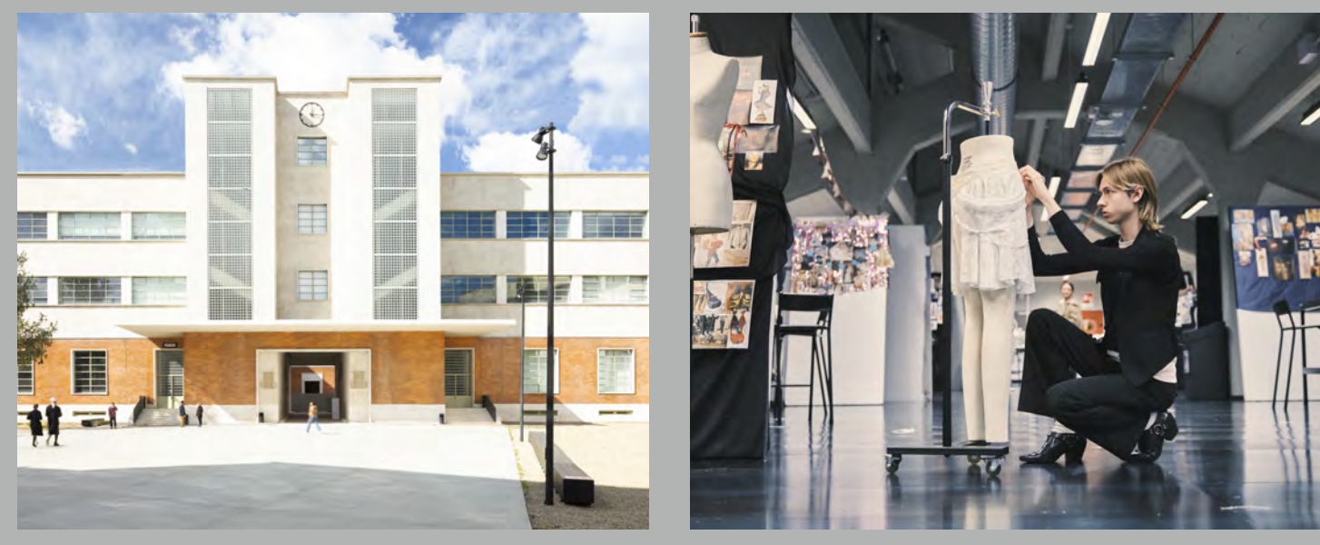
Polimoda - Manifattura Tabacci

Shortlisted candidates will be invited to the admission interview.