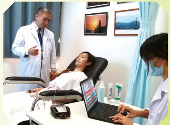
Mind and cognition