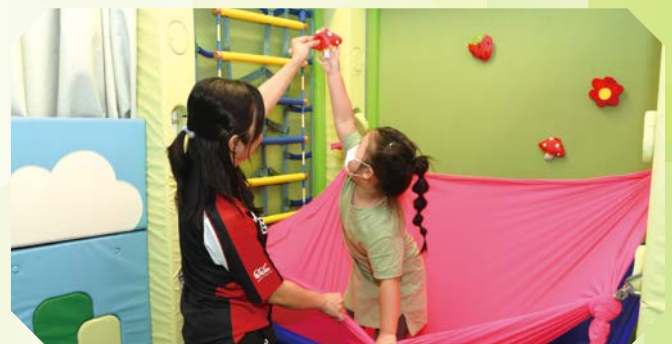
Learning and developmental disabilities