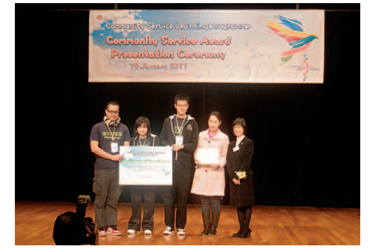
Congratulations to our EAG physiotherapy student team

We are very proud of our students' performance, and we will encourage them to continue to learn and develop through serving the community. Irrespective of winning or not, participation itself deserves commendation. By