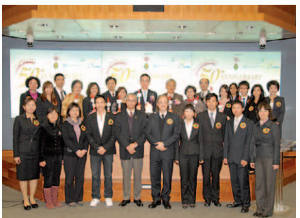
Officiating guests and representatives of the graduates after the torch relay ceremony

17 & 18 Dec 2010 Golden Jubilee Celebrations of Physiotherapy Education in Hong Kong