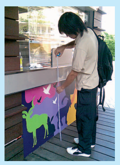
One of our members taking measurements at a counter in a park

2009 and over 250 sites were assessed. We acted as the leaders in contacting sites, scheduling the visits, allocating manpower, performing on-site assessments, and collecting and reporting the data. In each group, about 20 volunteers (including people with disabilities, elderly people, and students, as well as junior year OT students) carried out on-site research into designated tourist attractions including arts