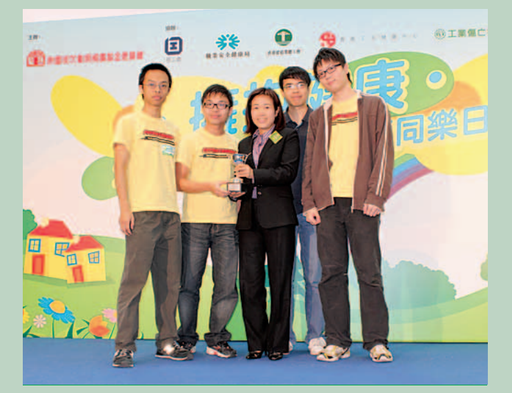
The champion team was presented with the trophy at the prize presentation ceremony

our relationships with our fellow classmates and enhanced our knowledge of respiratory disorders.