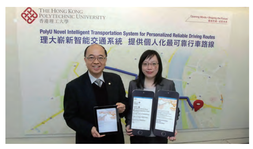
Novel Intelligent Transportation System

A novel intelligent transportation system has been created to help motorists identify a personalized reliable driving route, with the development of an integrated algorithm for real-time journey time estimation. This system integrates and optimizes traffic data including offline travel time forecasts; filtered real-time automatic vehicle identification data; and real-time video detector data. This helps to provide further information to traveler at a destination, such as traffic network uncertainty.