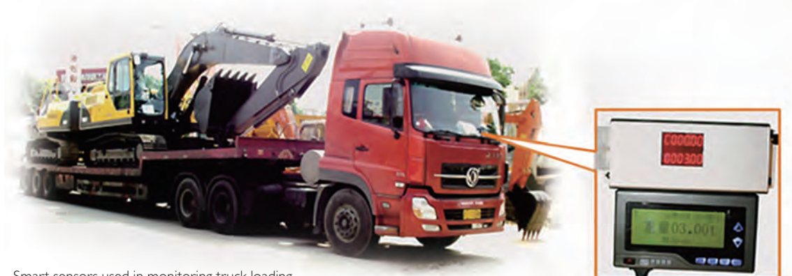
Smart sensors used in monitoring truck loading

Automatic truck loading monitoring system integrates smart sensors, mobile communication and global positioning technologies, for smart logistics management and road safety control. This system is capable of fast truck-status checking, weight recording, loading data transmission, tracking and monitoring, position localization, logistics scheduling, a user interface, security control and emergence management.