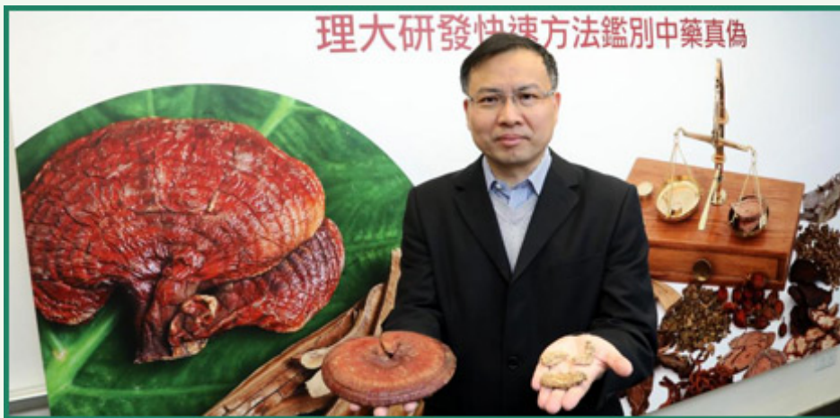
PolyU develops rapid authentication method of Chinese medicines >>>