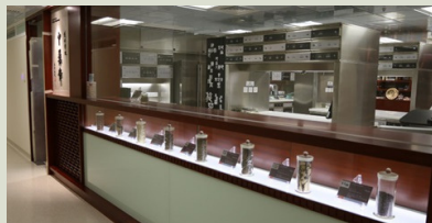
Herbal Medicine Learning Center