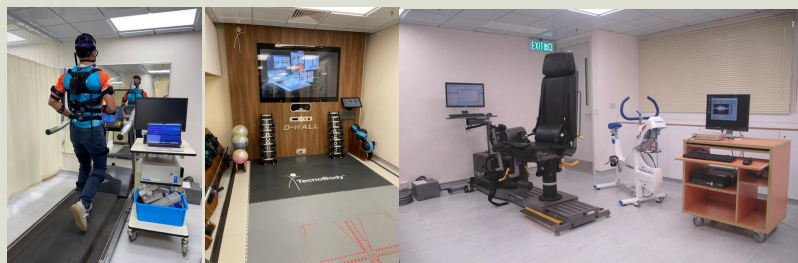
Exercise and Wellness Laboratory