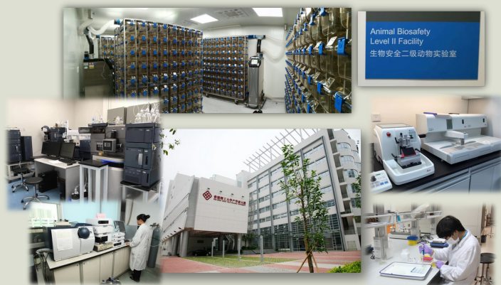
The Hong Kong Polytechnic University Shenzhen Research Institute