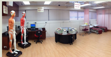
The Yuen Yuen Institute Chinese Medicinal Nursing Laboratories