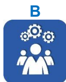
Community, Organisation and Globalisation