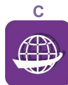
History, Cultures and World Views