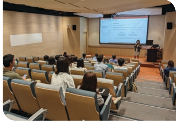
Department of Logistics and Maritime Studies: Research Postgraduate Student Symposium