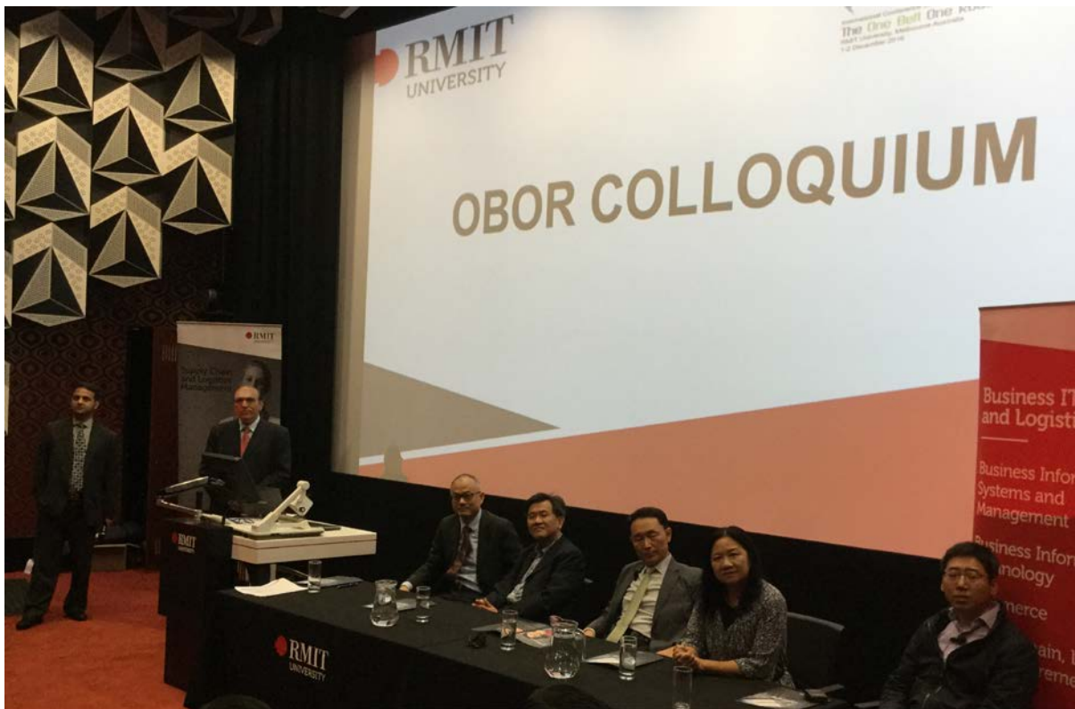
Group photo with keynote speakers and discussant