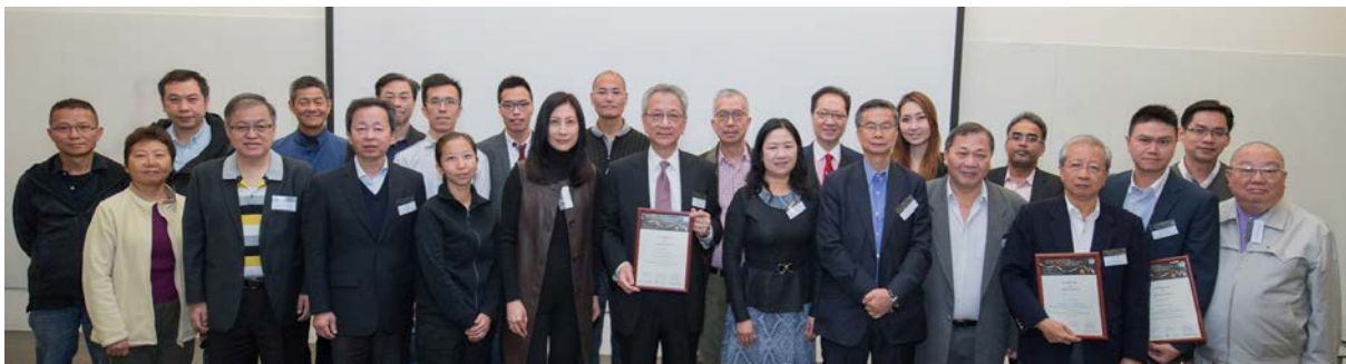
Group photo: organisers, supporting organisations, and speakers

https://www.polyu.edu.hk/lms/en/centres/src/OBORForum/