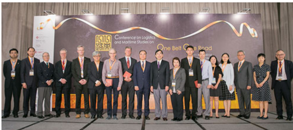
Guests and organizing members at opening ceremony

The Department of Logistics and Maritime Studies (LMS) hosted a conference on 10 to 11 May 2016 to officially kick-start dialogue and collaboration between potential participants and contributors to the Silk Road Economic Belt and 21st Century Maritime Silk Road, also known as the One Belt One Road (OBOR) Initiative. The event saw the gathering of economists, scholars, researchers, executives, government officials, and representatives from professional bodies for an in-depth discussion about the OBOR Initiative with particular emphasis on policy coordination, shipping connectivity, trade facilitation, and financial integration.