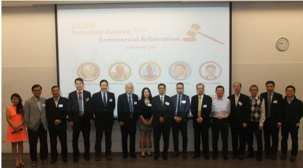
Guests and Speakers of the CILT 2-day Course

Supported by the SRC, the CILTHK two-day course on “Commercial Arbitration” was held on 9-10 April 2016 at V322 of The Hong Kong Polytechnic University. The organizer of this event was The Chartered Institute of Logistics and Transport (CILT). Co-organizers included The Hong Kong Institution of Engineers (Logistics and Transport Division), the Hong Kong Association of Risk Management and Safety, and the Institution of Mechanical Engineers (Hong Kong Branch). More than 200 participants attended this event.