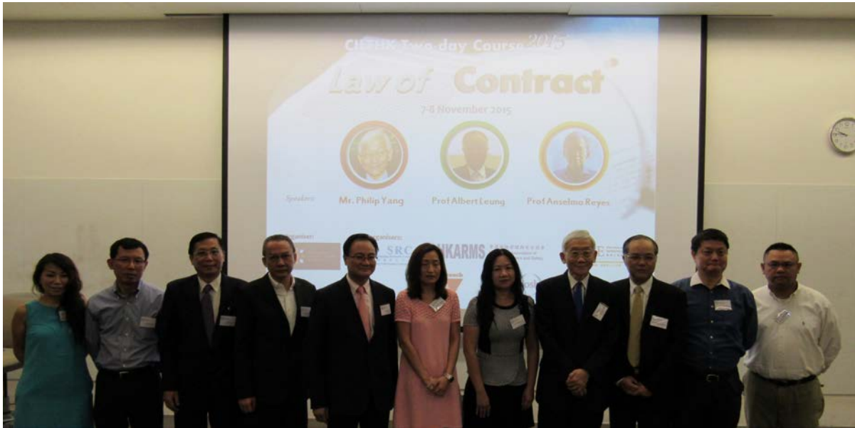
Group photo of speakers and organizers