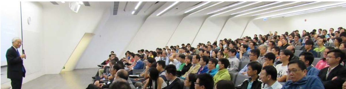
This event drew 300 participants from industry and academia

The organizer of this event was The Chartered Institute of Logistics and Transport (CILT) in Hong Kong. Co-organizers included Shipping Research Centre (SRC), Hong Kong Association of Risk Management and Safety (HKARMS), The Hong Kong Institution of Engineers (HKIE) Logistics and Transport Division, Institution of Mechanical Engineers (Hong Kong Branch), and The Institution of Occupational Safety and Health (IOSH) Hong Kong.