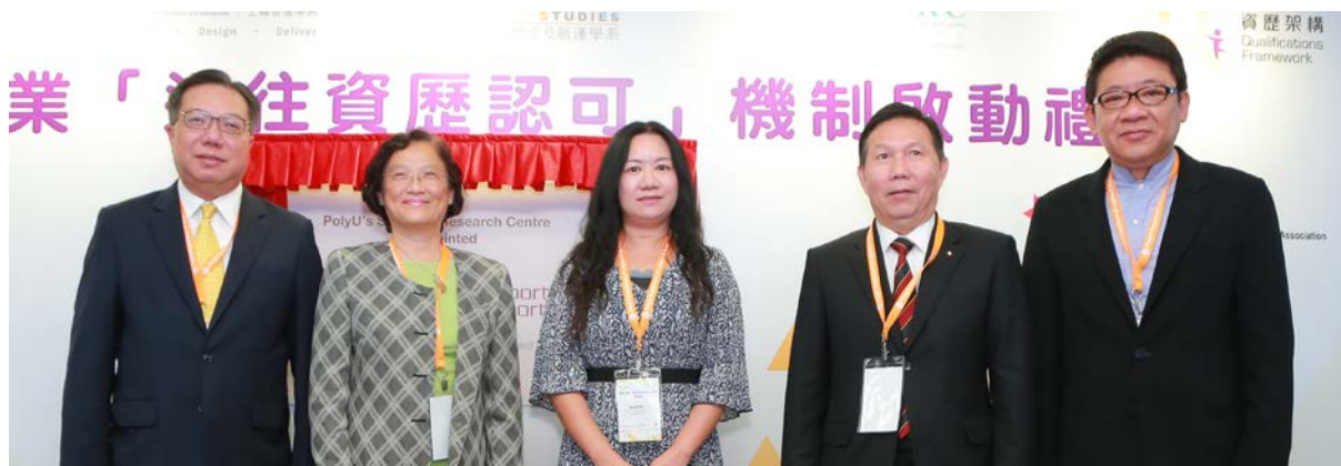
Director of SRC with the representatives of the four RPL Collaborators

The import and export industry has implemented the Recognition of Prior Learning (RPL) mechanism since 1 September 2015, and the Shipping Research Centre of The Hong Kong Polytechnic University (PolyU) was appointed the assessment agency. The launching ceremony was held on 6 October 2015 under the joint auspices of the Qualifications Framework Secretariat and PolyU. The event was co-organized by The Hong Kong Chinese Importers' & Exporters' Association, The Hong Kong Exporters' Association, Hong Kong FTU Qualifications Assessment Centre Limited, and The Hong Kong General Chamber of Small and Medium Business.