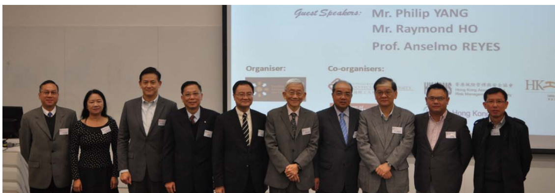
CILTHK 2-day Course organizers and guests