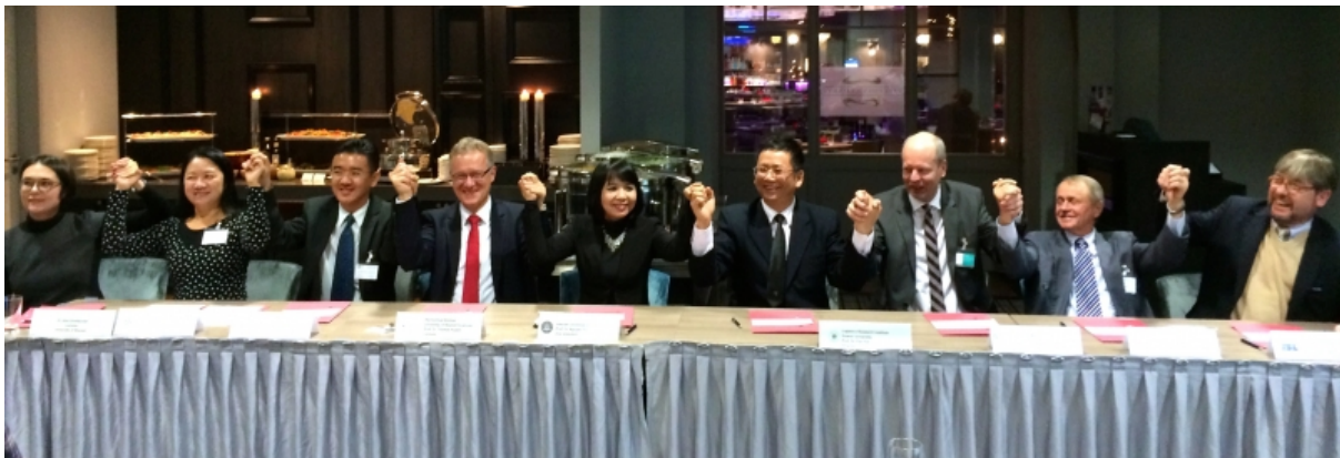
Founding members of AGKN

The AGKN was launched by the University of Bremen as a web-based platform for communication and knowledge sharing between selected universities in China and Vietnam as a joint project funded by the Federal Ministry for Education and Research. The aim of this project was to develop and realize an approach on how to enhance the visibility of German research structures in the Asia Pacific Research Area (APRA) in the specific field of transport and logistics.