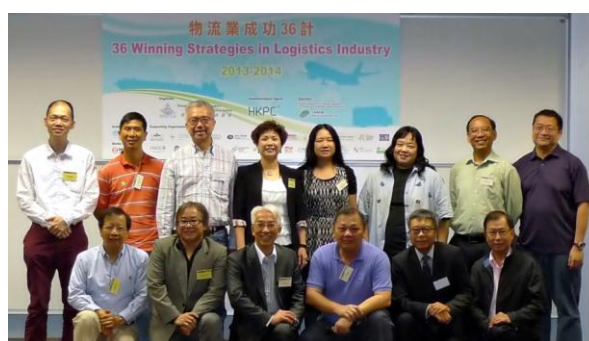
Members of organizing committee

The third seminar will be held on 20 July 2013. Details of the seminar are as follows: