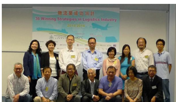
Speakers and members of HKSTLA

The second seminar was held at Lecture Theater N001, The Hong Kong Polytechnic University, on 15 June 2013. The seminar was supported by more than 20 local professional organizations and drew together over 100 practitioners.