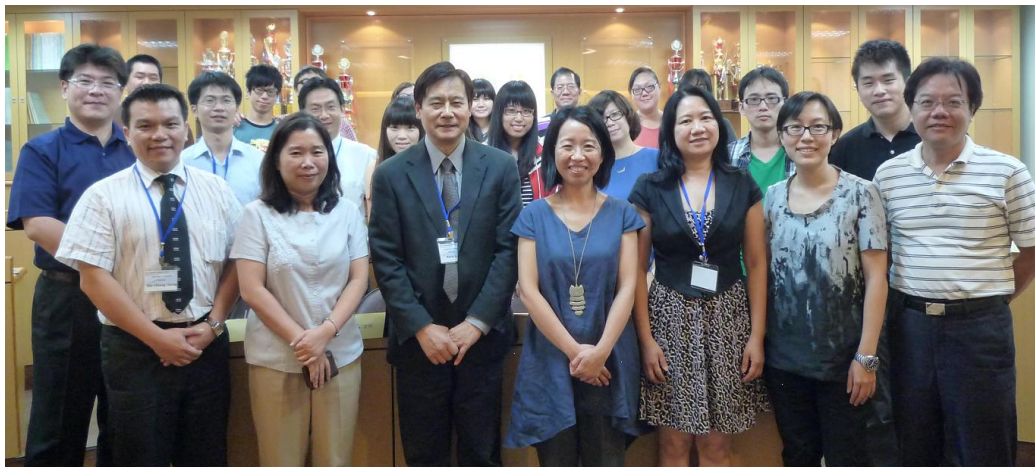
Speakers with Department Head of Department of Shipping and Transportation Management, faculty members and graduate students of NKMU