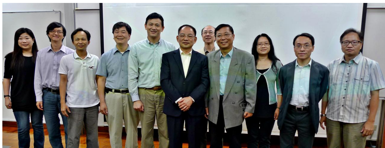
Speaker and organizers of the seminar