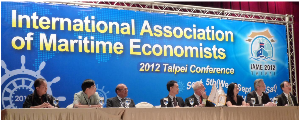
Editors of scholarly journals join the IAME “Meet the Editors” session

The 2012 International Association of Maritime Economists (IAME) Conference was held on 5-8 September 2012 in Taipei. A “Meet the Editors” Session was arranged on 8 September 2012. SRC members were invited to participate in the session to represent such scholarly journals as the International Journal of Shipping and Transport Logistics , International Journal of Production Economics , and OMEGA .