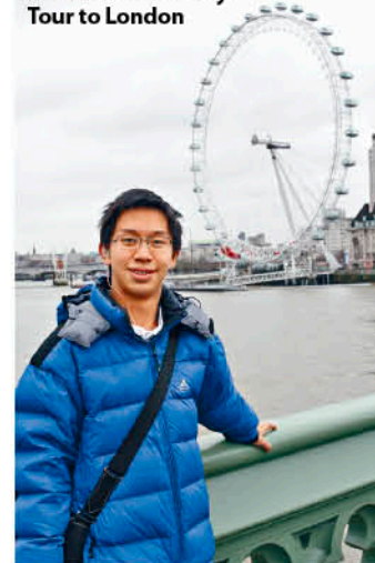
International Study Tour to London