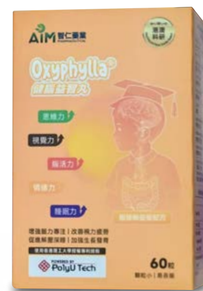
Nephrokin®: a patented natural New Dietary Ingredient (NDI) for brain health