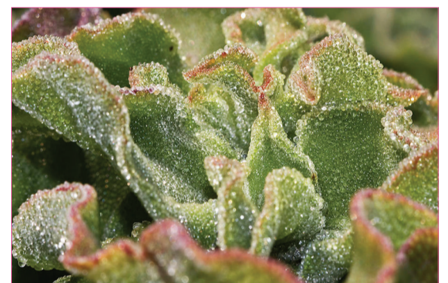
冰草 Salty Ice Plant

Patent Application No.: CN 201510347106.3 (China)