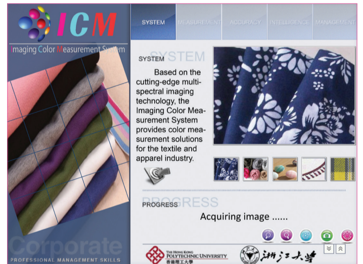
ICM系統介面 ICM System Screen Interface

The ICM system is the world first measurement instrument capable of measuring spectral reflectance over the visible spectrum from 400 – 700 nm with a very high accuracy. It measures colours of multi-colour samples ranging from printing fabrics, yarn-dyed fabrics, laces, yarns, threads, to coloured plastics, cosmetics, as well as automotive parts. The colour measurement capability of ICM system can be further extended to any multi-coloured, irregular shaped, extremely small 3-dimensional objects. It completely overcomes the limitation of measuring any multi-colour sample by a spectrophotometer that is the only type of accurate spectral colour measurement device available today.