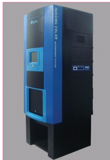
ICM系統 Imaging Colour Measurement System