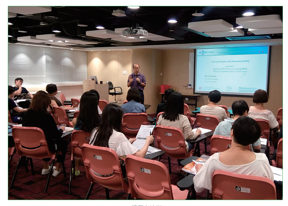
照顧者培訓 aregivers training

健康及認知評估服務是一項集合篩查和健康諮詢的服務。我們為所有人士及家屬提供服務,亦接受社會及健康專業人員的轉介。