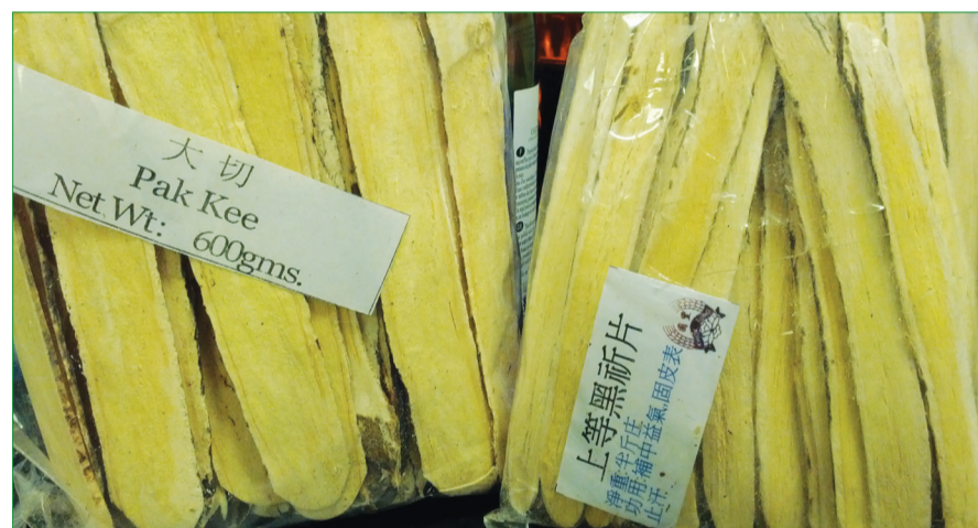
中草藥樣本 Herbal Medicines