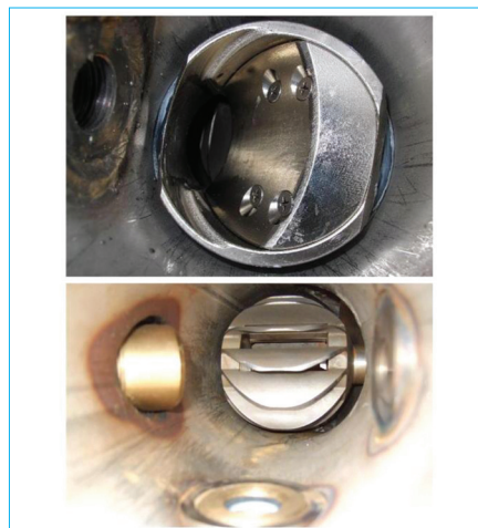
安裝在水管內的噴嘴和葉輪， 入水口（上圖）和出水口（下圖） The nozzle and impeller installed inside the pipe, viewed from the water entry (top) and water exit (bottom) side respectively