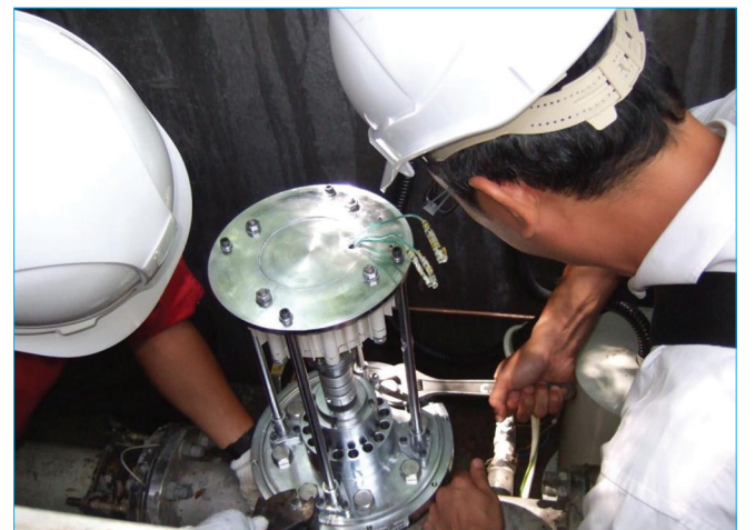
採用微型發電機，適合在狹窄的地下水管空間安裝 The hydro generator system is compact for installation in the narrow underground space of water mains pit

To ensure reliability of a city's drinking water and saline water supply, the performance monitoring of its underground water pipe network is very important, but it is always not easy to provide electric power supply to the monitoring devices due to limited underground space and transportation restriction. A novel inline mini hydroelectric system, which includes an eye-shape inlet nozzle and the multi-blades vertical-axis spherical hollow impeller, was developed which can not only convert the superfluous water head into electrical power, but can also be installed in limited space, especially at remote areas without utility grid.