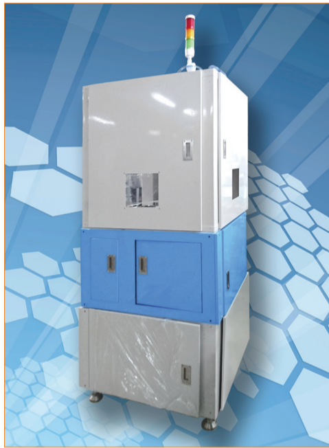
精密微納印壓設備 The micro-embossing equipment

傳統的光學零件是通過用近紅外線加熱的熱壓縮過程而成型的，壓模的加熱和冷卻過程都很緩慢，消耗大量能量。理大開發的嶄新精密微納印壓設備只需運用少量能量，便可於玻璃工件上製成具光學微結構的光學零件。這台設備以碳化鎢和矽膠作為壓模材料，可以快速加熱及對工件溫度進行實時測量，解決了傳統加工方法的主要問題，如加工緩慢、模具製造和壓力控制困難等，能夠精準而快速地壓印非球面小型鏡頭和光學微結構，如微鏡陣列等。