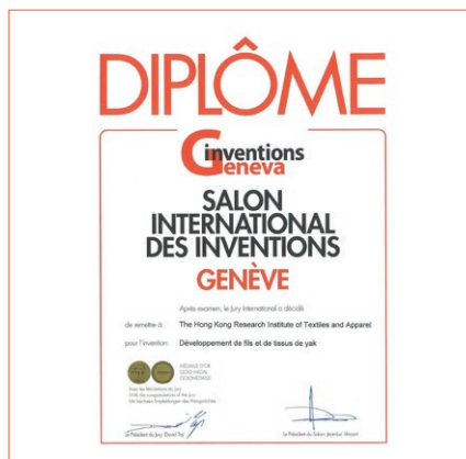
The development of fine worsted yak yarns and fabrics won a gold medal in the 45 th International Exhibition of Inventions of Geneva.

That means yak down is almost as soft as cashmere, with the potential to be knitted into luxury clothing items. Besides, yak fibres are more breathable and warmer than cashmere and merino wool. All in all, yak down fibre makes very comfortable fabric that is soft, warm and breathable, but it costs much less than cashmere," said Dr Xu.