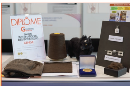
Yak fibre, yak yarn and yak fabric

Cashmere has been the material of choice among fashionistas and those discerning few because of its lightness, softness and warmth. But there is a new kid on the block that threatens its claim to the throne in the textile world – yak fibre. Yes, the shaggy bovid always shown in pictures with the snow-capped Himalayas in the background. While their outer fibres are long and coarse, their down undercoat is almost as soft as cashmere, being slightly warmer and more breathable than cashmere. However, yak down fibres are very short in length so that it is difficult to obtain a fine yarn with good strength, low hairiness and smooth surface from them. In light of this, Dr Bingang Xu, Associate Professor, Institute of Textiles and