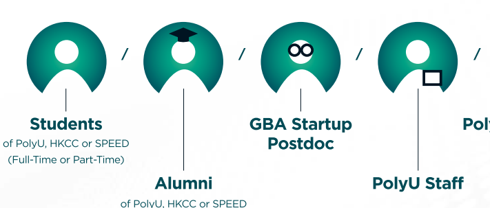
A team with at least one of the following PolyU members as the Principal Applicant