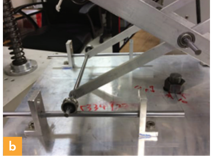
A prototype of the SLS platform: the prototype (a) and rollers in a horizontal track and bearings in rotational joints assembled in the system (b).

The X-shaped bio-inspired structures are novel designs of passive vibration isolation systems by using only linear spring and damping components to achieve superior nonlinear vibration isolation. The technology provides excellent passive quasi-zero stiffness of high loading capacity, and nonlinear high damping at resonant frequencies but low at others, without unstable nonlinear equilibrium. The structure can provide flexible and adjustable stiffness up to zero and adjustable nonlinear damping characteristic. The stiffness is decreasing with the increase of compression or extension of the structure, different from existing spring systems which have higher stiffness subject to more compression or extension. The technology is easy to implement and flexible in usage of low cost. The systems can be with n-layers of X-shaped structures to suit different applications, such as leg/joint design of robots, limb-like structured suspension for mobile robots with track, protection of high-precision machinery, space launch and on-orbit applications.