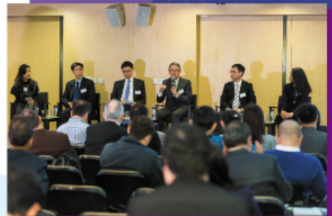
Sharing from CLP Power Hong Kong Limited, MTR Corporation, New World Development Company Limited, Synergis Management Services Limited, The Hong Kong and China Gas Company Limited (Towngas) on their service improvement programmes