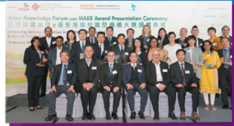
Group photos of the honorary guests and the MAKE Award Winners