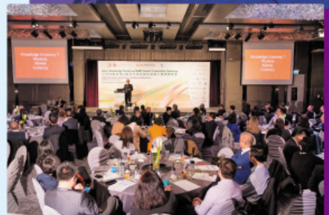
Global successful pioneers and practitioners from Asia Miles, IDEO, Fung Group HK, Fuji Xerox and Silicon Valley shared their success in service innovation