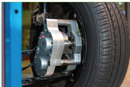
The electromechanical brake (EMB) of the Smart All-electric ABS

Prof. Cheng explained, "Oftentimes, you have to step harder on the brake in cold weather. The brake fluid also leaks easily and can be contaminated by moisture. In both cases, braking ability is retarded, and the braking system responds slower than usual, which could be dangerous. That's why car owners need to check and replace brake fluid regularly, and that adds to the maintenance cost. The moisture in brake fluid also rusts the metal component in the hydraulic system, making it less durable." Finally, the brake fluid contains organic solvents and is highly flammable. Generally speaking, it needs to be replaced every two years and could be hazardous to the environment if not disposed of properly.