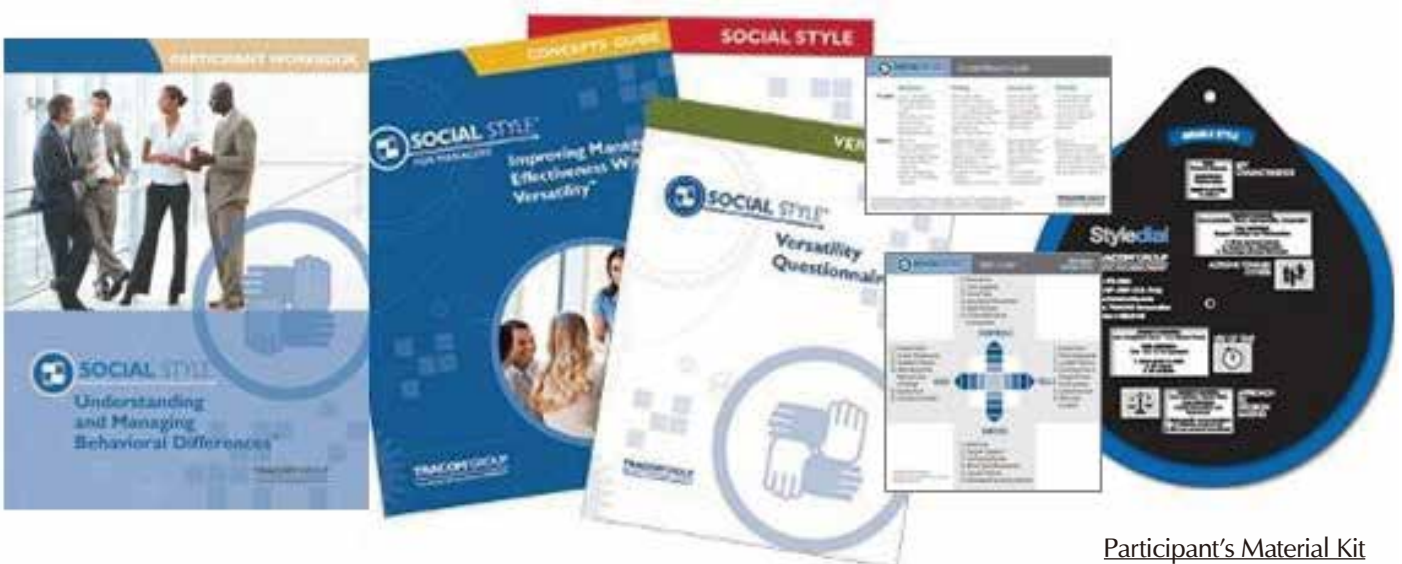
Participant's Material Kit