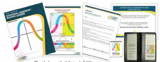
Participant's Material Kit

"Excellent teaching skill and I learnt a lot from your teaching."