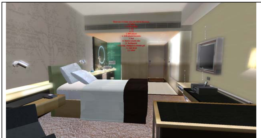
One of the three virtual hotel rooms used in the first stage of the study

Over a four-week period, participants visited the hotel rooms, reviewed the amenities and selected their preferred brands. Participants came from 39 countries including USA, Canada, UK, Germany, Holland, Australia and Hong Kong. Preliminary results indicate that coffee, TV, toothpaste, shampoo and shower gel are the most preferred products to be branded in a four-star hotel room setting. The most preferred brands for each item was also identified. While Starbucks, Nescafe and Folgers were the top three coffee brands favoured by respondents, Sony, Panasonic and Samsung were the most preferred TV brands respondents would like to see in the rooms. Respondents also indicated that Dove, Pantene and Herbal Essences topped their list as the most preferred shampoo brands, whereas Colgate and Crest surfaced as their No. 1 brands for toothpaste.