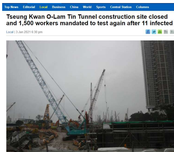
News reporting COVID-19 cases in Construction Sites in January 2021