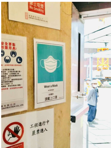
Posters / Signages with Information of Precautionary Measures are Put On at Construction Sites

Site workers are required to wear a surgical mask properly to fully cover the mouth, nose and chin at all times. Hand sanitizers are provided at construction sites and the site office for use. They are also reminded to wash hands thoroughly before eating, after touching public installations such as door knobs, etc.